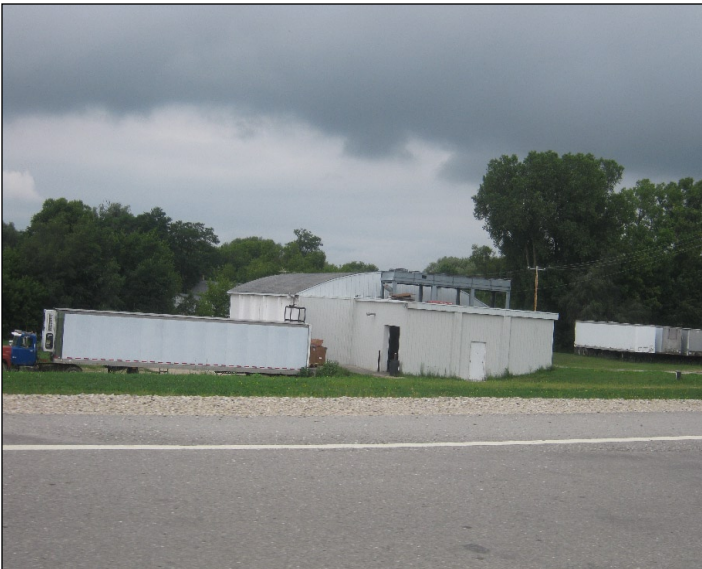
UNITED FEEDS PLYMOUTH, WI