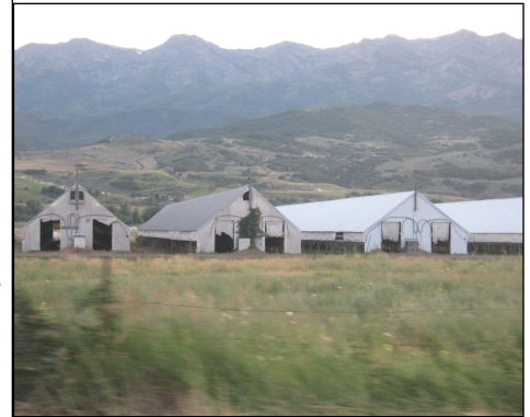
WARDELL FUR FARM ENTERPRISE, UT