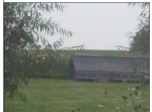
ANDREW & SONS FUR FARM UNION, IA