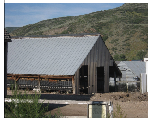
D & B FUR FARM PEOA, UT