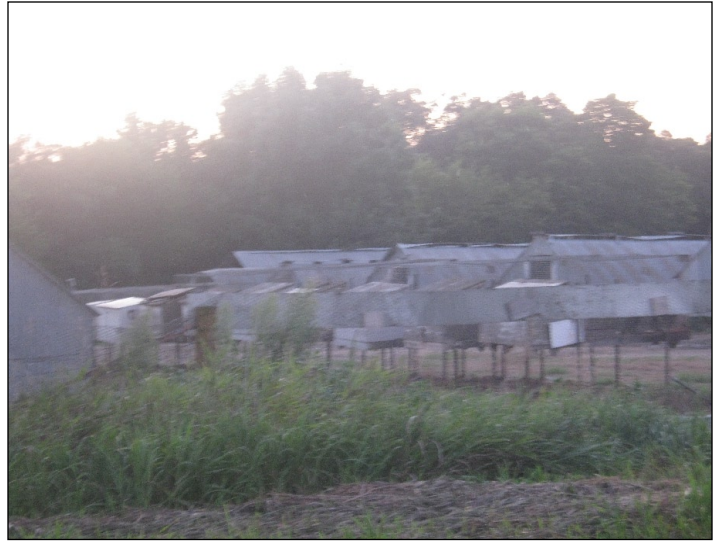
FOX PENS @ PERRIN & SONS FUR FARM CHEROKEE, IA