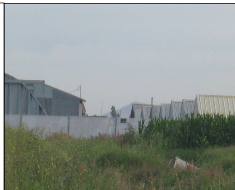
BLACKRIDGE FARMS HYRUM, UT

Notes: Conflicting reports place either this or the Zimbal Minkery as the largest fur farm in the country. 100,000 mink. Located at corner of N 10400