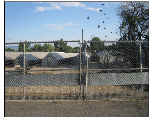
MARGETT'S MINK RANCH WEST JORDAN, UT