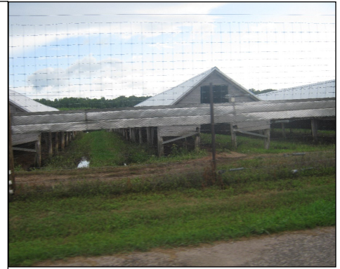
WEISMAN MINK RANCH CAROLINE, WI

Notes: New info. Name previously published without address. Appearance of a small farm on satellite images, just south of this address, south of corner @ 91st Place.