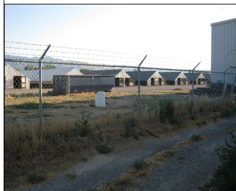
NEWLY DISCOVERED FARM LEHI, UT