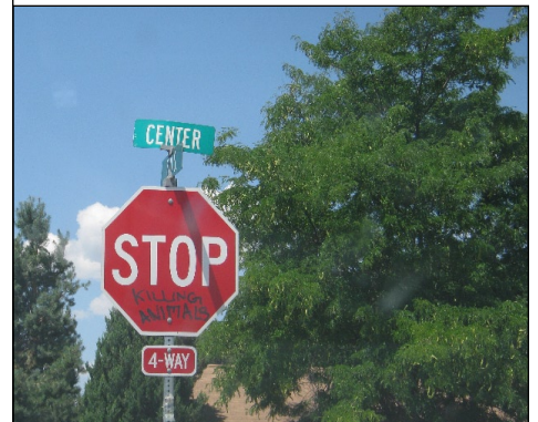
STOP SIGN OUTSIDE 7878 W 8170 N LEHI, UT