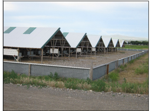
SMITH MINK FARM MALTA, ID