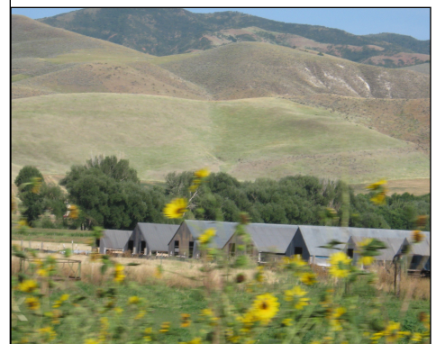
1225 S. MORGAN VALLEY DR. MORGAN, UT