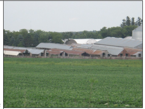
DREWELOW & SONS NEW HAMPTON, IA

Notes: Single, very small animal shed with cages seen in fenced-off yard beside house. Contents undetermined / not visible.