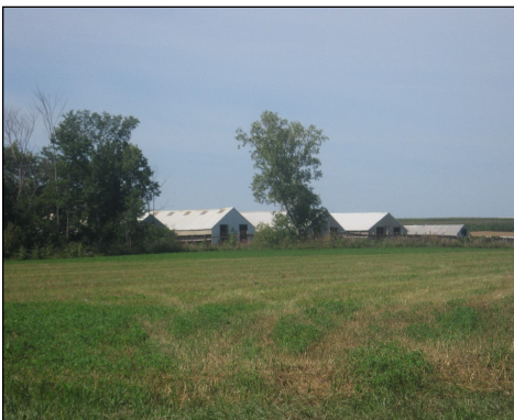
LANGER FARMS KEWAUNEE, WI