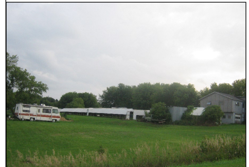
FUR FARM ELKHART LAKE, WI