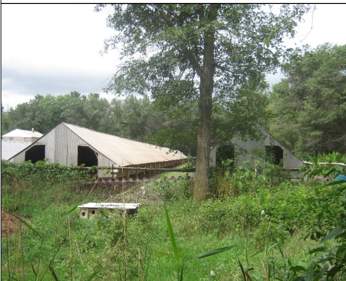
GEIGER MINK FARM MOSINEE, WI