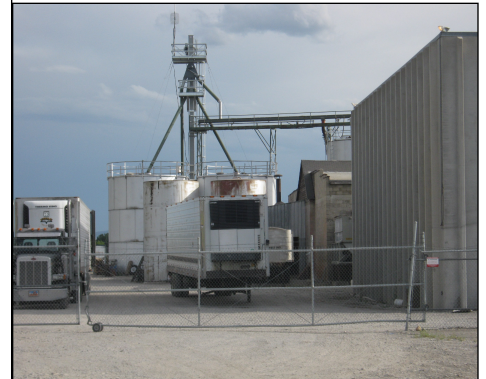
FUR BREEDER'S AGRICULTURAL CO-OP LOGAN, UT