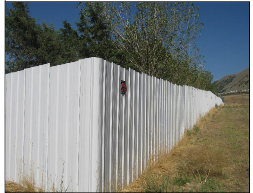
NEWLY DISCOVERED MINK FARM DRAPER, UT