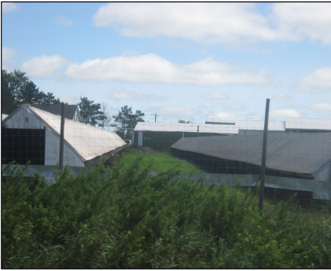
ROMIE DEML MINK RANCH MEDFORD, WI