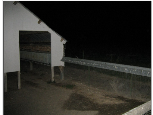
MOYLE MINK FARM FILER, ID