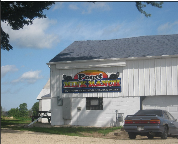
PAGEL MINK RANCH CAMBELLSPORT, WI