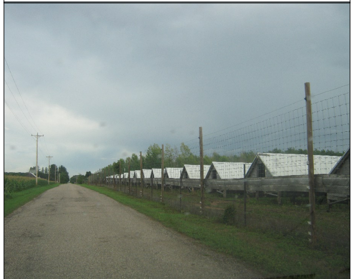
WIESMAN MINK RANCH CAROLINE, WI