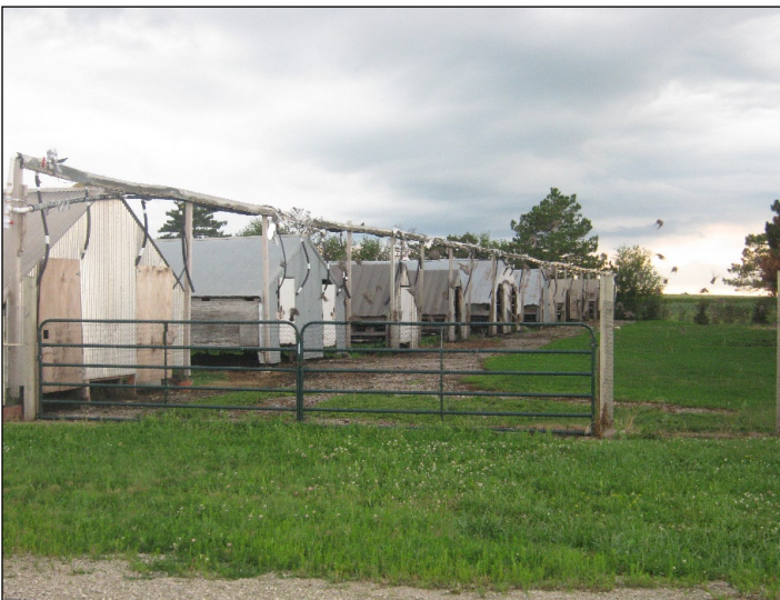
ISEBRANDS FUR FARM JEWELL, IA