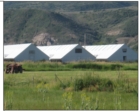
MARCHANT'S PEOA, UT