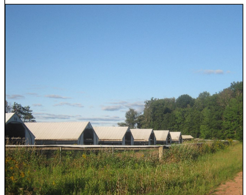
BRECKE MINK RANCH STETSONVILLE, WI