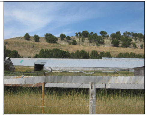
DEAN VERNON & SONS COALVILLE, UT

Notes: 11 sheds. Located north of Highland Highway/Highway 92. Street address is approximate.