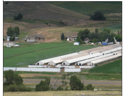
REES'S FUR FARM COALVILLE, UT