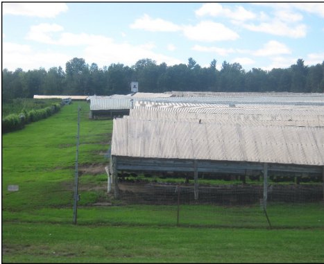
JENTZSCH MINK RANCH MEDFORD, WI