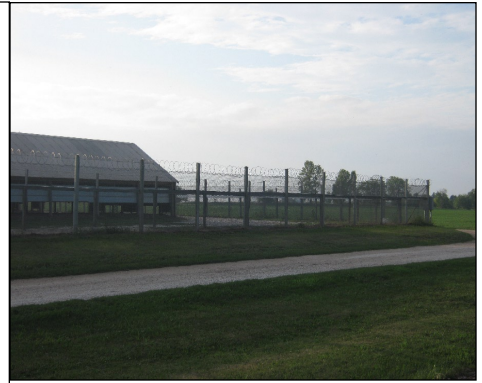
ZIMBAL MINKERY OOSTBURG, WI

Notes: New address. Name of farmer previously published in Final Nail #3. Satellite images show the appearance of a fur farm.