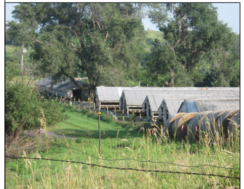
CIRCLE K FUR FARM SIOUX CITY, IA