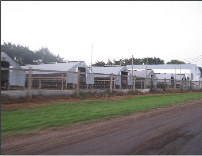
PERRIN & SONS FUR FARM CHEROKEE, IA