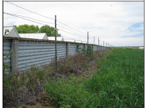
GEARY FUR FARM BURLEY, ID