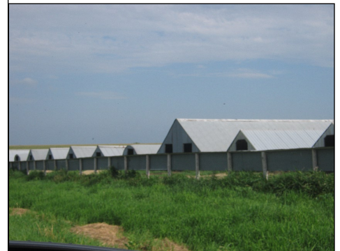
WOODRING FUR FARM FREDERICKSBURG, IA