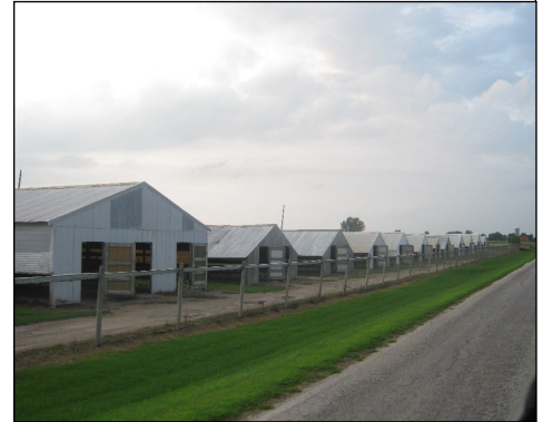
D & N MINK NEW HOLSTEIN, WI

downhill. Visible from the beginning of 5th Ave, E side. Paperwork obtained lists this address as open, and as housing mink and fox. First name is from Secretary of State records, second from fur industry documents.