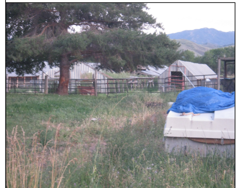
LARGENT FUR FARM STODDARD, UT