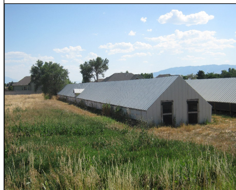
J & G MINK RANCH HIGHLAND, UT