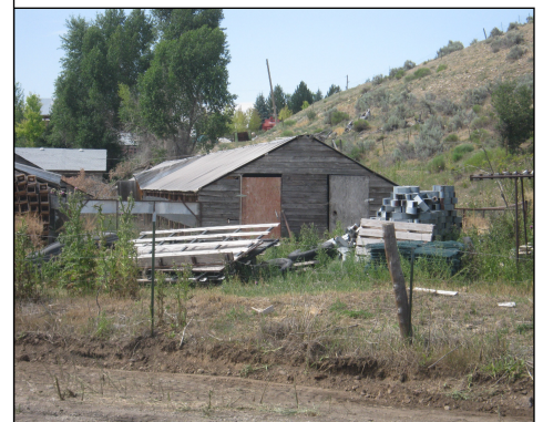
BK MINK RANCH COALVILLE, UT