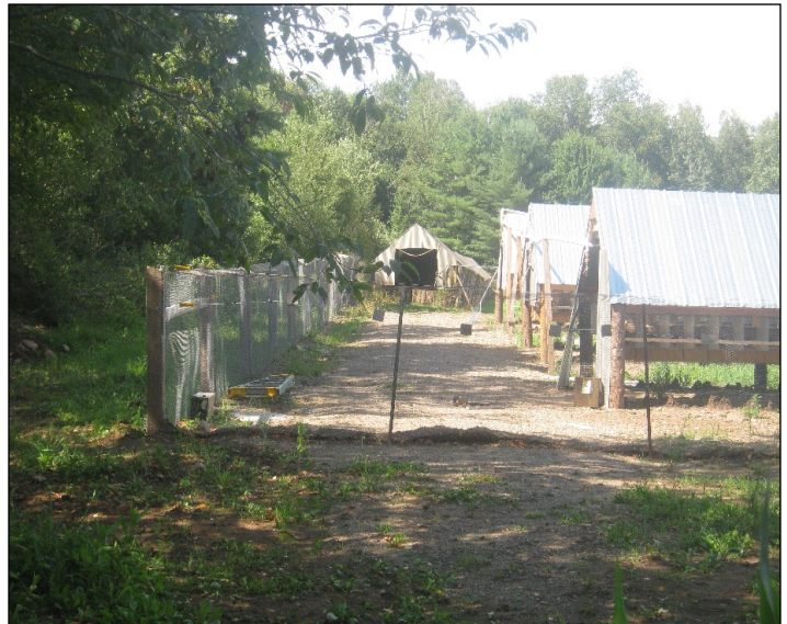
MILDBRAND MINK RANCH MEDFORD, WI