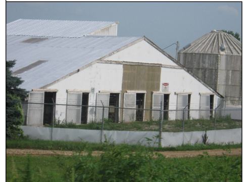
UNDERWOOD FARM FREDERICKSBURG, IA