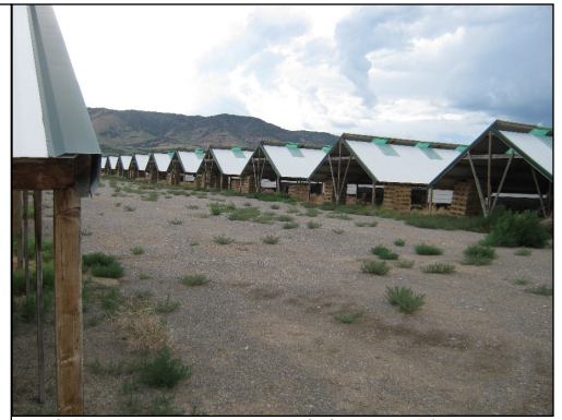
NEWLY-BUILT MINK FARM MALTA, ID

Fur Farm 1175 South Highway 81 Malta, ID Status: Likely to be a newly constructed farm. Species: Empty mink cages found. Notes: New, unlisted farm on W side of Highway 81. Buildings appeared to be newly constructed. Approximately 50% of the farm surveyed. All cages found empty. Likely to open in the near future. No house on site.