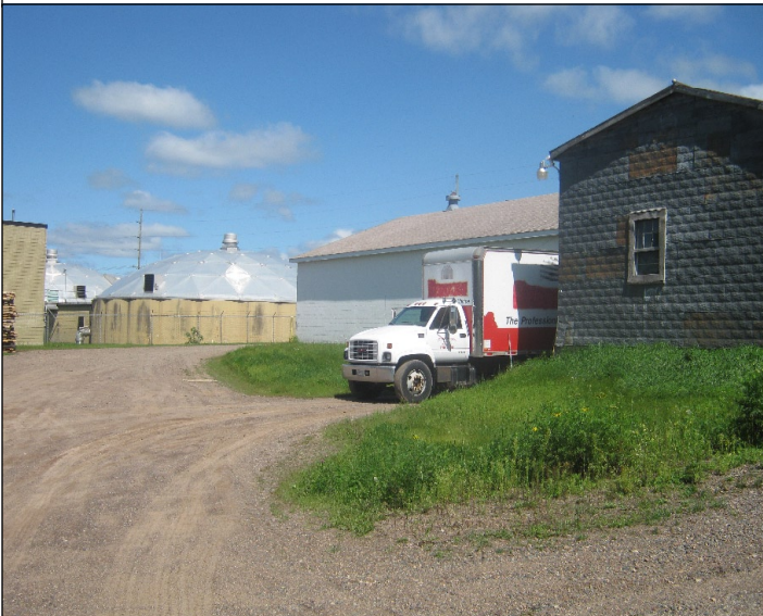
MEDFORD MINK FOOD MEDFORD, WI