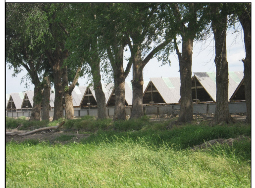
MOYLE MINK FARM HEYBURN, ID