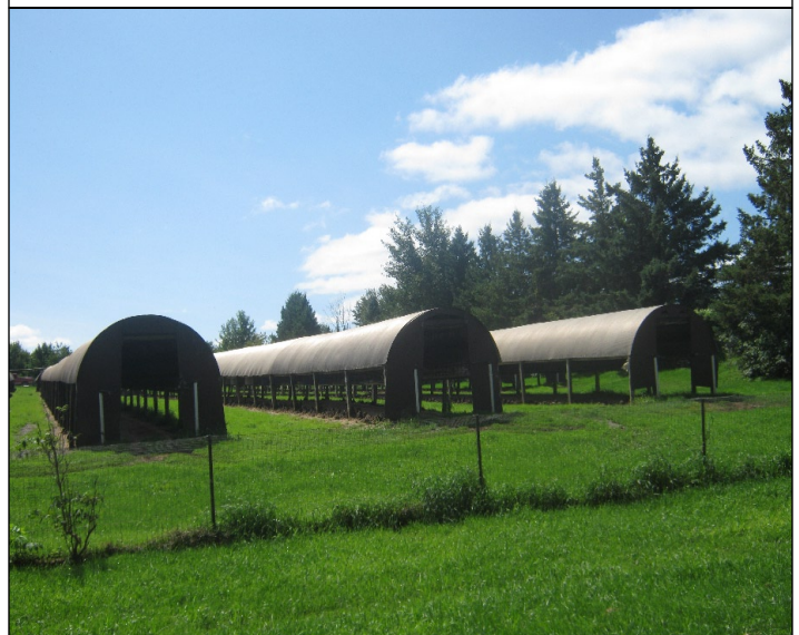
ALBERS MINK RANCH MEDFORD, WI