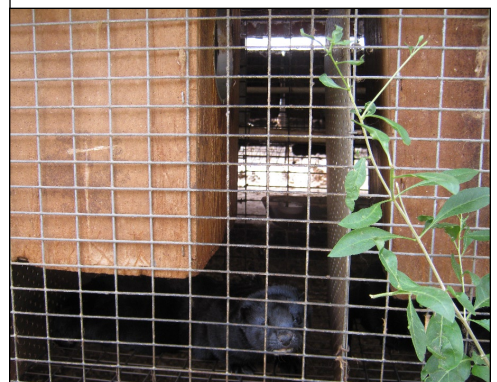
CAGED MINK @ UTAH MINK FARM