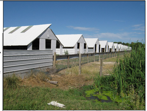
HARRIS MINK FARM CALDWELL, ID

Notes: Set back from road at end of driveway. On a river. Furthest sheds are at a distance from the house. Two houses on the property.