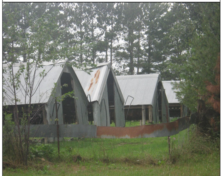
GESSLER'S PINE RIDGE MINK RANCH TOMAHAWK, WI