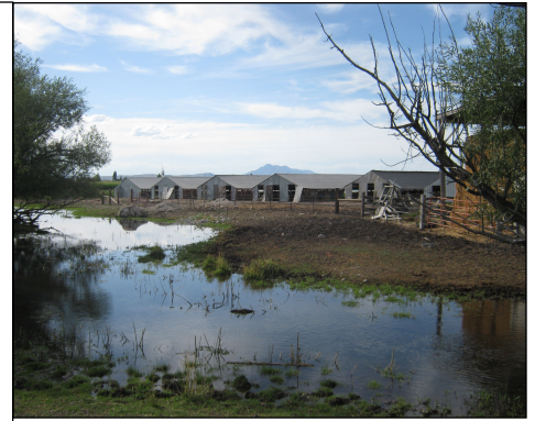
JENSON FUR FARM LOGAN, UT

Could not be conclusively declared as dosed.