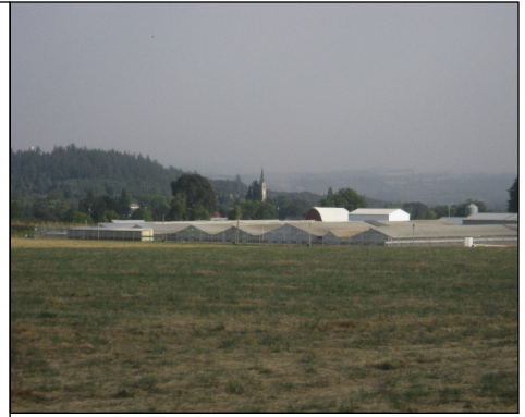
ARRITOLA MINK RANCH MOUNT ANGEL, OR

Ylipelto's Fur Farm 92659 Simonsen Loop Road Astoria, OR 97103 Veikko & Eeva Ylipelto Status: Confirmed open by media reports, 2009. Species: Mink. Notes: Located on east side of road.