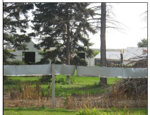
MISTY MOONLIGHT MINK RANCH WAVERLY, IA