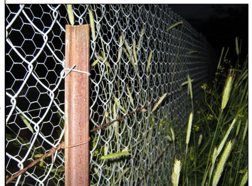
B&D FUR FARM MALAD, ID