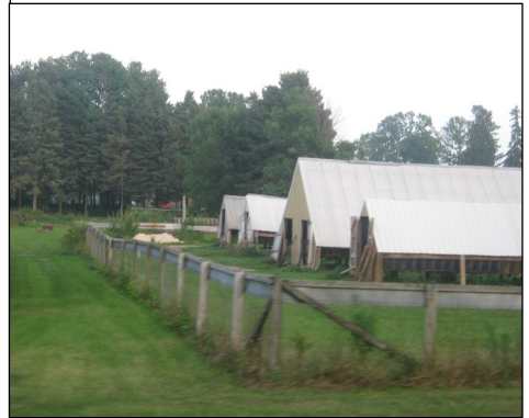
SMIES FUR FARM OOSTBURG, WI