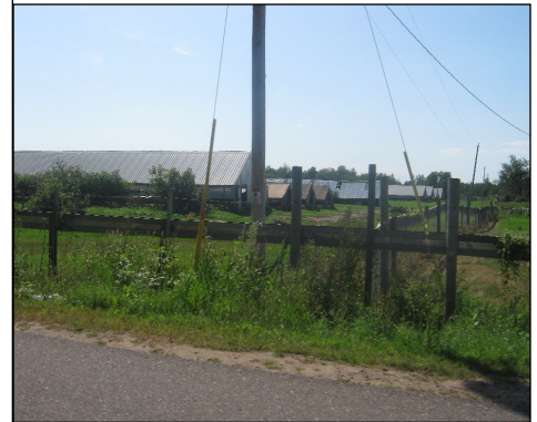
NORTHWEST MINK RANCH BRUCE, WI