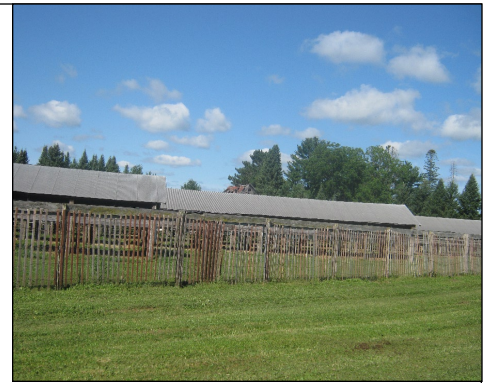
MAGNUSON FUR FARM OGEMA, WI