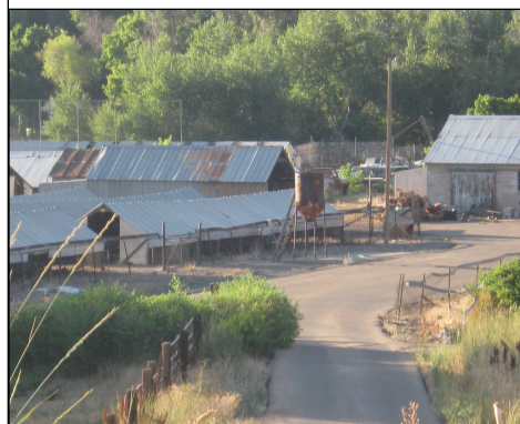
SARGENT MINK RANCH MORGAN, UT