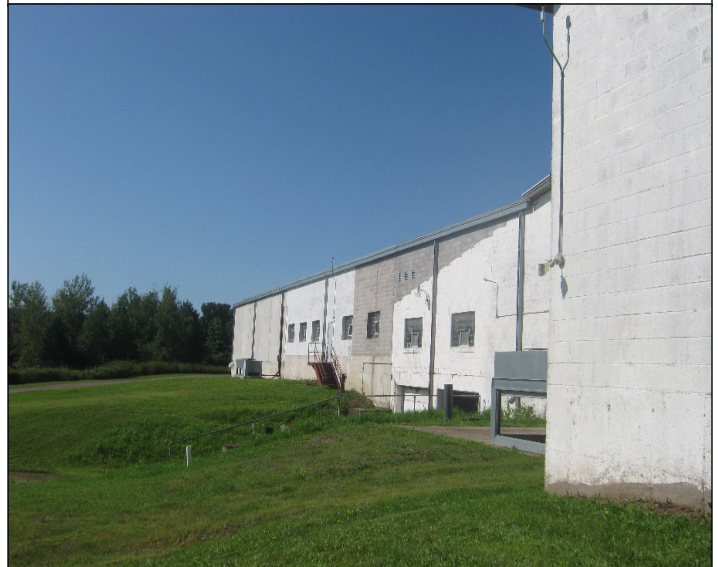
MEDFORD FUR FOOD MEDFORD, WI