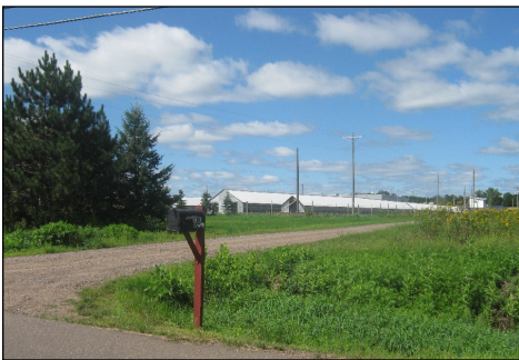
ED DITTRICH MINK RANCH MEDFORD, WI