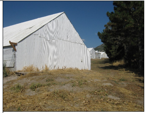
NEWLY DISCOVERED MINK FARM DRAPER, UT

Mink Farm End of N 200 E Coalville, UT Status: Confirmed open, 2009. Species: Mink Notes: Fence around sheds. Shallow creek around south and east of property on Park Rd. Borders county fairgrounds on the west. Most visible from Park Rd. Sheds directly adjoin shallow creek on west side of fairgrounds parking lot.