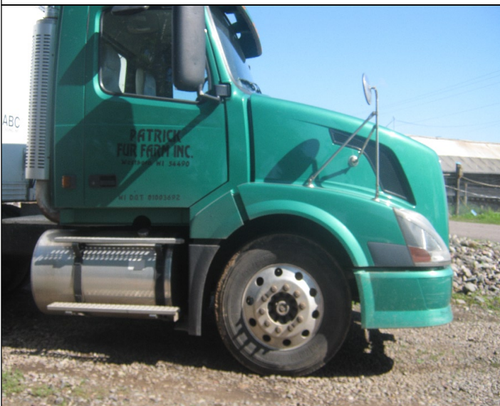
PATRICK FUR FARM WESTBORO, WI