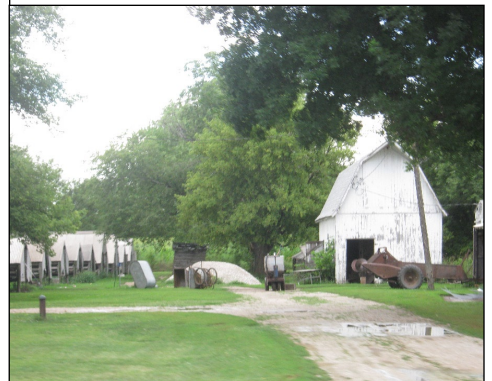
FASSETT FUR FARM WEBSTER CITY, IA