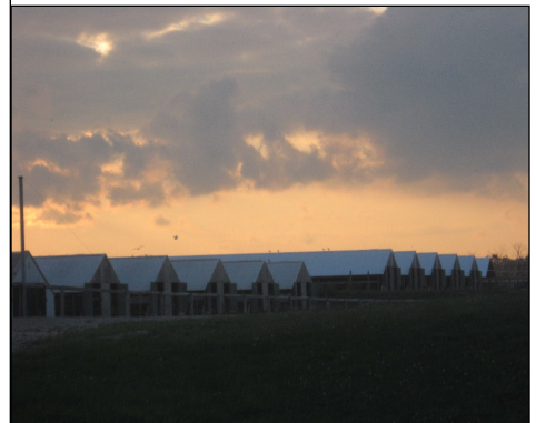
NEWLY DISCOVERED FUR FARM OOSTBURG, WI