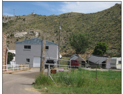
BLACK WILLOW MINK COALVILLE, UT