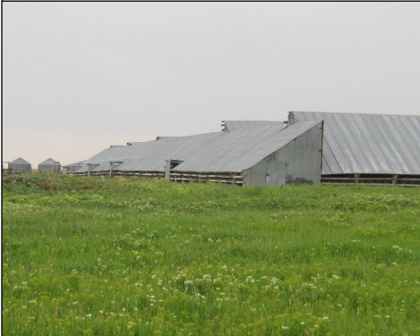
HENKE FUR FARM HOBSON, MT