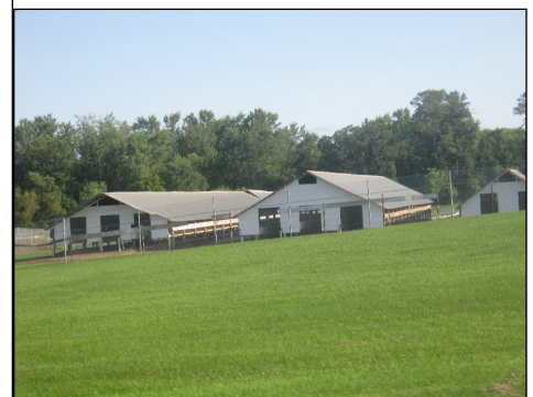
SMIEJA FUR FARM INDEPENDENCE, WI