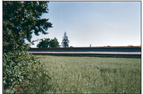
JEFFERSON FUR FARM JEFFERSON, OR