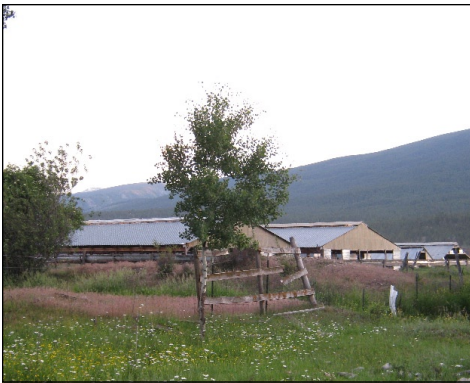
ROCKY MOUNTAIN FUR COMPANY HAMILTON, MT