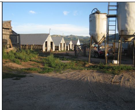
DAWSON MINK FARM MORGAN, UT