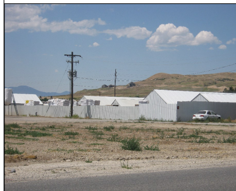
DANE DIXON MINK RANCH LEHI, UT