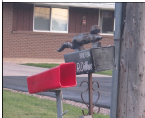
DILLREE FUR FARM STODDARD, UT