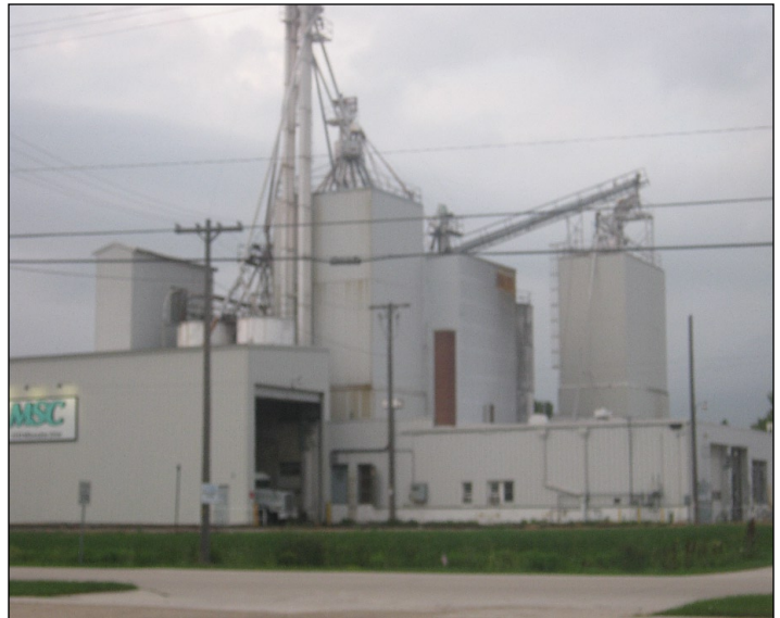
NATIONAL FUR FOODS NEW HOLSTEIN, WI