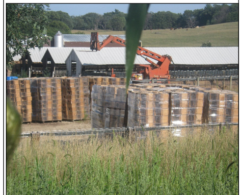
RENOVATION OR DECONSTRUCTION. GOLDEN SANDS RANCH WILD ROSE, WI

Notes: Address and status unknown. Two possible alternate addresses investigated; one was a storage unit, the other a lumber mill.