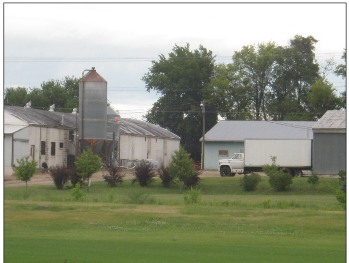
HAWKEYE MINK COOPERATIVE JEWELL, IA