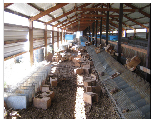
ABANDONED MINK FARM HENEFER, UT