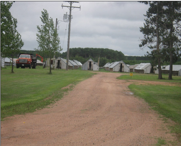
AMES MINK FARM TOMAHAWK, WI