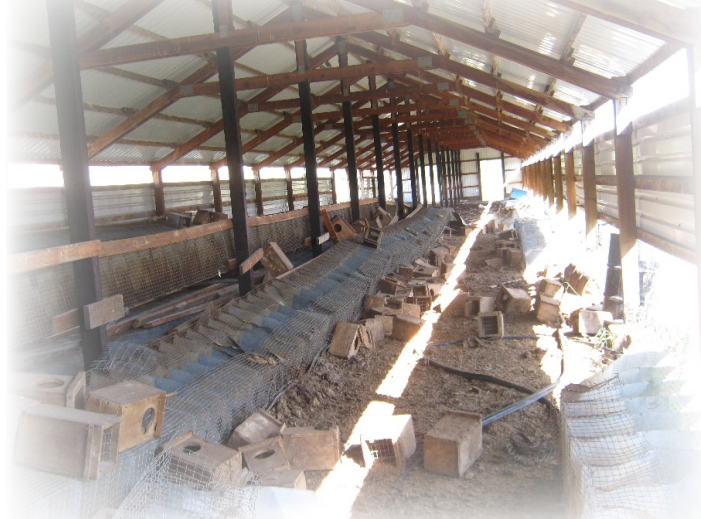
FARMS FOUND CLOSED, OR NOT AT THEIR PUBLISHED ADDRESSES.

WHAT FOLLOWS IS A LIST OF MINK & FOX FARMS WHOSE ADDRESSES HAVE BEEN PREVIOUSLY PUBLISHED IN EITHER THE FINAL NAIL #S 1 - 3, OR WWW.FINALNAIL.COM , AND FALL INTO TWO CATEGORIES: