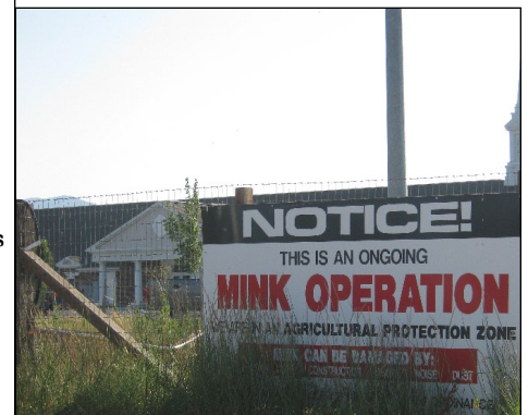
SIGN POSTED @ UTAH COUNTY MINK FARMS